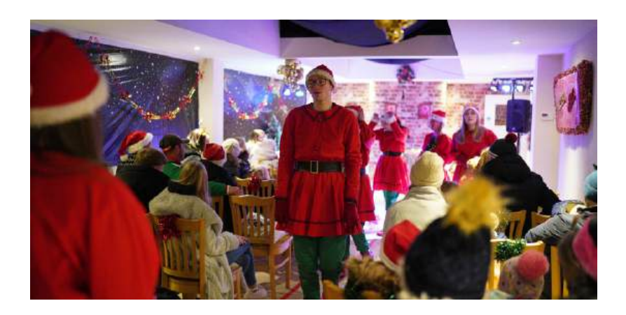
You will sit inside the Elf Workshop.